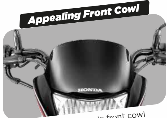
Appealing Front Cowl

Beautiful tank and side graphics increase your shine.