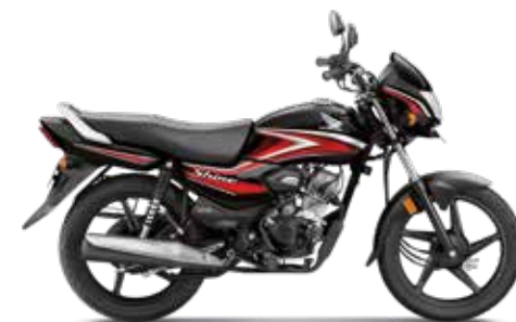
Black With Red