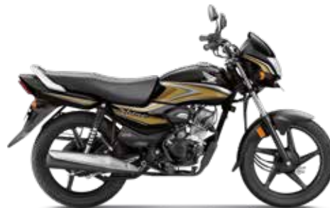
Black With Gold