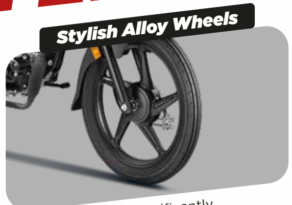
Stylish Alloy Wheels