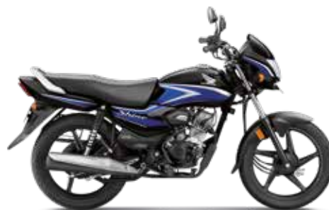
Black With Blue