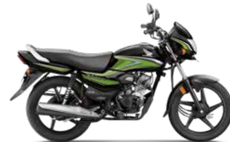
Black With Green