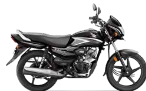
Black With Grey

BOOK ONLINE NOW! www.honda2wheelersindia.com